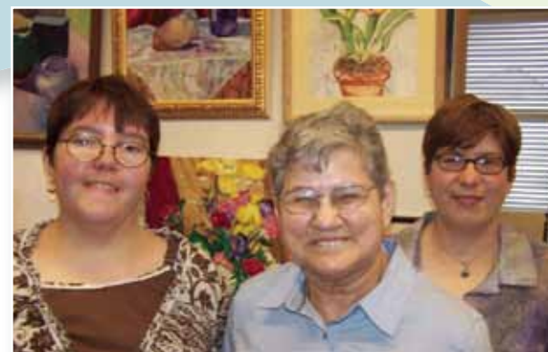
Funds to help pay for dental work to make beautiful smiles.