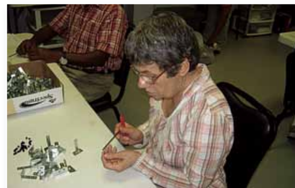
Vocational training to gain more independence.