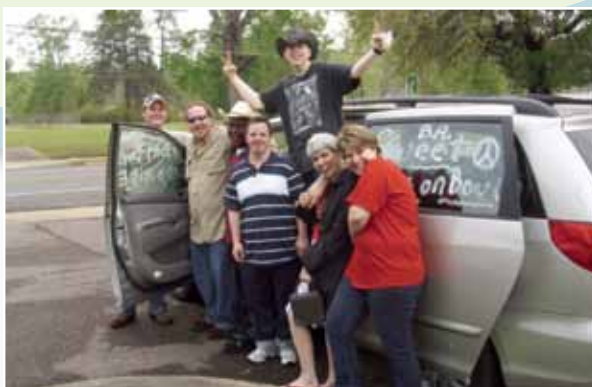
Recreational activities and abundant life!